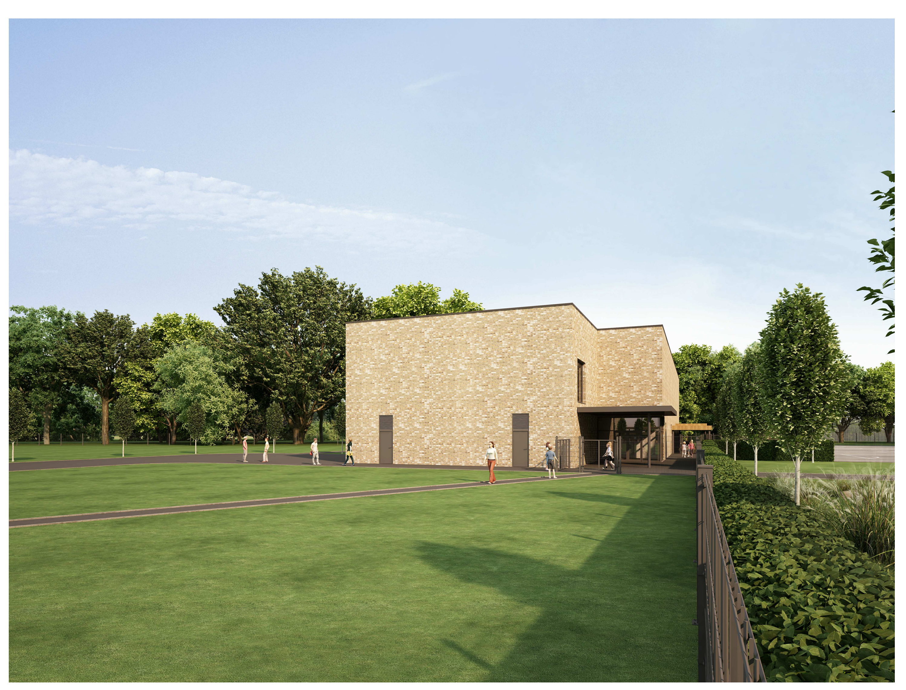
Sports Hall - External View 1 - NTS