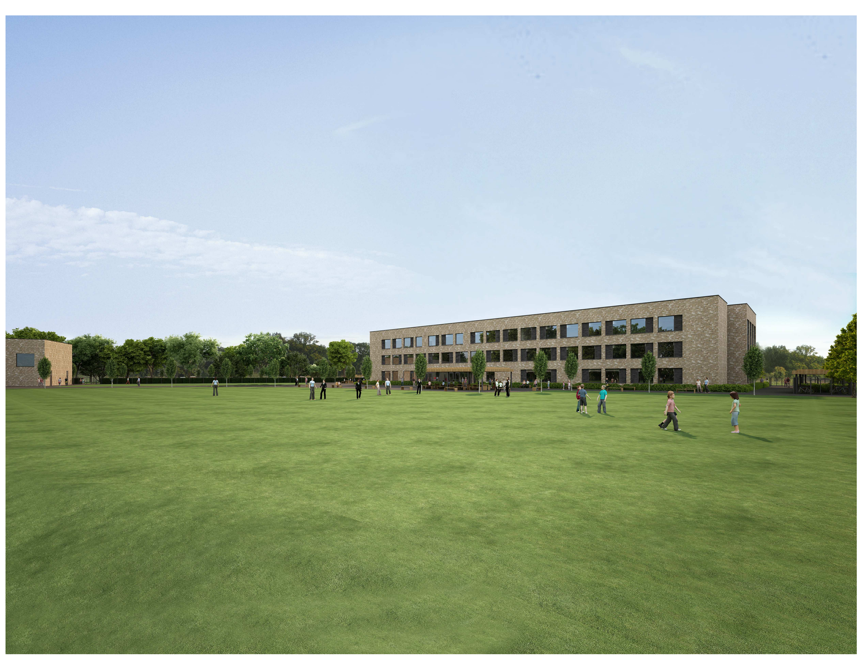
Sports Hall & Main Building- External View 2 - NTS