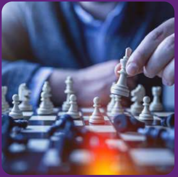
Play board games/puzzles