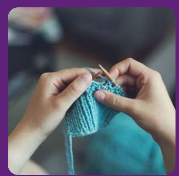
Learn a craft on YouTube – knitting, crocheting, needle felting