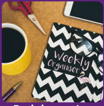
Do jobs you've been meaning to do.