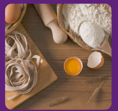
Cook / Bake