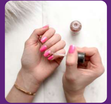
Do your nails, take a long bath and the other things you never get chance to do in your normal busy life